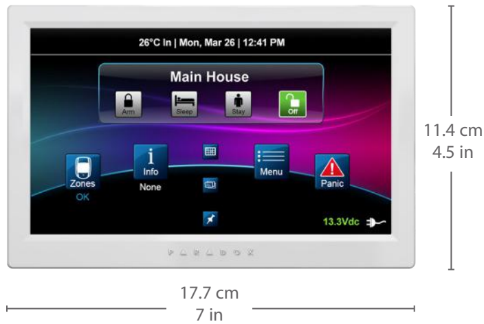
TM70: Intuitive Touchscreen