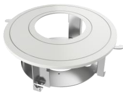
DS-DS-1227ZJ-DM42 In-Ceiling Mount