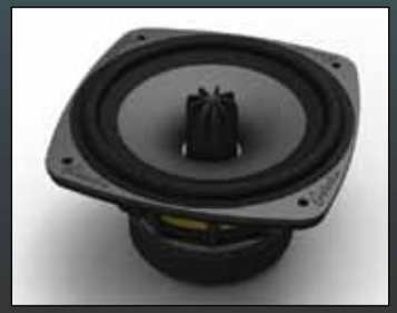
5.25" HIGH-DEFINITION BASS/ MIDRANGE DRIVER