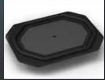
QUADRATIC PLANAR INFRASONIC RADIATOR