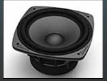
5.25" HIGH-DEFINITION BASS/ MIDRANGE DRIVER (XXL)