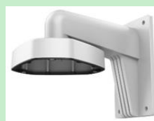
DS-1273ZJ-DM25 Wall mount