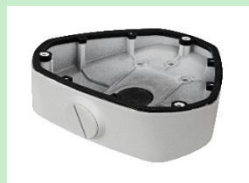
DS-1281ZJ-DM25 Inclined ceiling mount