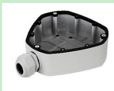
DS-1280ZJ-DM25 Junction box