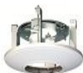
DS-1227ZJ In-ceiling mount